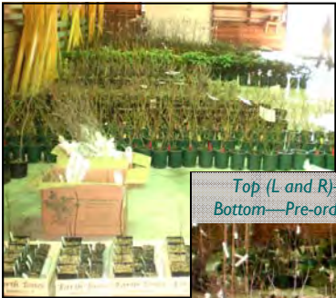
Top (L and R)—Plants lined up in preparation for sale. Bottom—Pre-ordered plants grouped and ready for pick-up.

The Plant and Seedling Sale and Fish Fingerling Sale were successful fundraisers, promoting ecological landscaping and open space enjoyment. Volunteer Master Gardeners assisted plant sale customers, answering many planting questions. A related workshop was held, entitled "Landscaping for Wildlife: Using Native Plants to Sustain Wildlife in your Backyard."