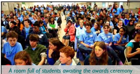
A room full of students awaiting the awards ceremony

A tremendous amount of staff time was dedicated to specific projects and grant work , which is described and depicted on the inside section of this document.