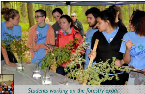
Students working on the forestry exam

The District coordinated the Connecticut Envirothon program. Educational workshops were held throughout the year for high school students to learn about aquatic, forestry, soil, wildlife, and the 2014 current issue, sustainable agriculture. The annual field day competition was held at the Tolland County Agricultural Center (TAC) in Vernon.