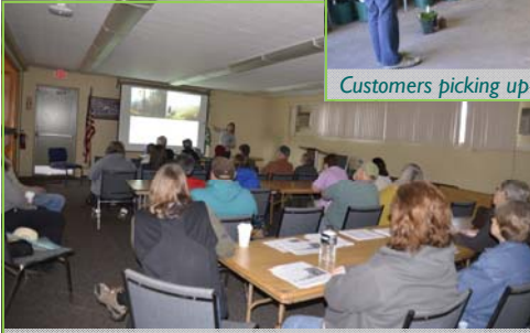
Members of the public attending the workshop

The District coordinated the Connecticut Envirothon program. Educational workshops were held throughout the year for high school students to learn about aquatics, forestry, soil, wildlife, and the vast 2016 current issue, Invasive Species, which was incorporated into each station and was the subject of the oral presentations, covering the relevant topics of prevention, introduction, spread, impact, and response. The field day competition was at the impressive Indian Rock Preserve educational facility in Bristol.