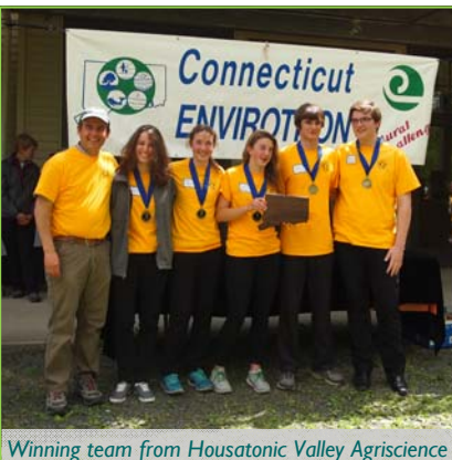
Winning team from Housatonic Valley Agriscience

The District coordinated the Connecticut Envirothon program. Educational workshops were held throughout the year for high school students to learn about aquatics, forestry, soil, wildlife, and the vast 2016 current issue, Invasive Species, which was incorporated into each station and was the subject of the oral presentations, covering the relevant topics of prevention, introduction, spread, impact, and response. The field day competition was at the impressive Indian Rock Preserve educational facility in Bristol.