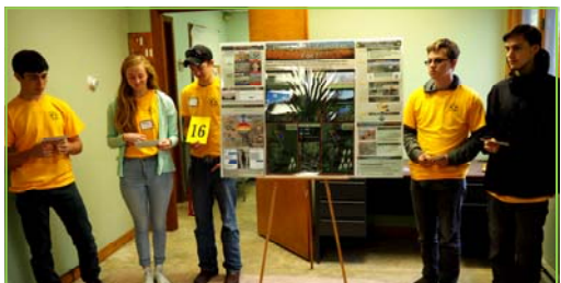
Students presenting on the topic of invasive species

Tremendous environmental benefit resulted from projects and grant work , further described and depicted on the interior section of this document.