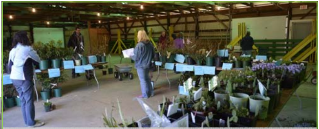
Customers picking up plant orders and shopping for additional plant offerings

The Plant and Seedling Sale and Fish Fingerling Sale promoted ecological landscaping and open space enjoyment, and also provided funds to support District programs. Volunteer Master Gardeners in both the current class and many previous classes assisted plant sale customers, answering many planting questions. An educational workshop was held during the plant sale, entitled "Landscaping for Birds, Bees, and Butterflies Using Native Plants." This year, online ordering was an option for the first time, a convenience that many customers appreciated.